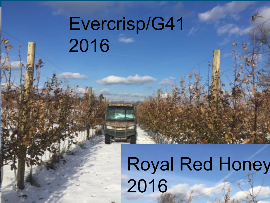
Royal Red Honeycrisp/G41 2016